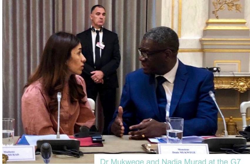
Dr Mukwege and Nadia Murad at the G7