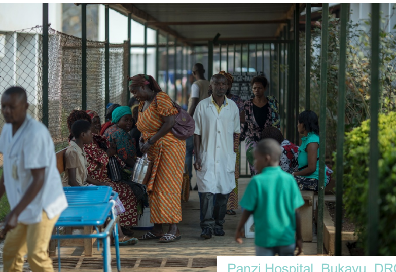
Panzi Hospital, Bukavu, DRC

started between the Mukwege and Panzi Foundations and the ICGLR Regional Training Facility (RTF) in order to reinforce survivors’ access to quality holistic assistance in the Great Lakes Region. The collaboration focuses on the integration of Panzi’s holistic model of care in the RTF’s training activities, which form part of an ambitious regional programme to train thousands of Sexual and Gender based Violence (SGBV) professionals in ICGLR member states, utilising a training of trainers approach. This integrated training will be piloted in the Democratic Republic of Congo (DRC), Zambia, Rwanda, Uganda and the Central African Republic by joint