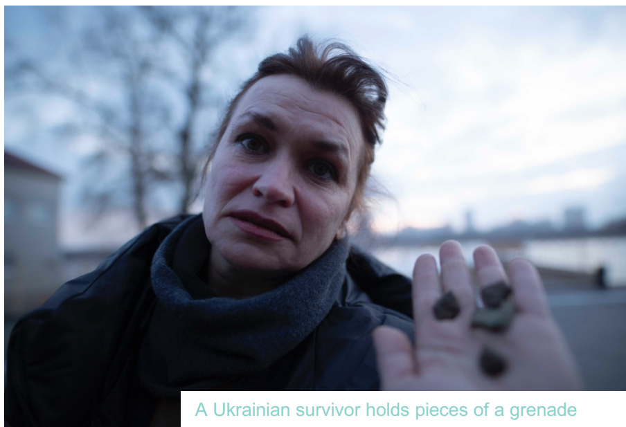
A Ukrainian survivor holds pieces of a grenade

Sexual violence has been used systematically by both sides in the armed insurrection in the Luhansk and Donetsk regions of Ukraine, and in the aftermath of Russia's occupation of Crimea. Women and men have suffered torture and sexual violence in illegal detention facilities and at checkpoints. Sexual violence has also been used to intimidate individuals and communities to force them to leave the territory. Victims report that they struggle to access appropriate psychological support, and stigma and fear of reprisals has meant that many survivors have not