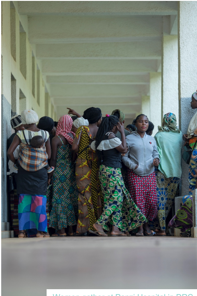
Women gather at Panzi Hospital in DRC

teams of Panzi expert trainers and trainers selected by the RTF. Several learning exchanges took place between May and November 2019. These meetings brought together a total of 60 trainers and experts and allowed the teams to exchange experiences both on training approaches and tools, as well as on key themes within Panzi's expertise, like holistic care,