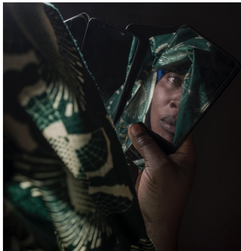
We see sexual violence in conflict through a gendered lens

Sexual violence is deeply rooted in a society's gender norms which determine what society expects of women and men, their roles, privileges and limitations. Gender inequality exists in all societies, also prior to conflict and displacement. In fragile or humanitarian settings, it becomes a fertile ground for the use of sexual violence as a weapon of war. We see sexual violence in conflict through a gendered lens. That means we understand that by 'weaponising' gendered roles, populations are more vulnerable to sexual