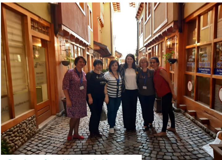
Survivors from Ukraine in Kosovo

For the Ukrainian survivors this exchange brought the realisation that survivors of conflict-related sexual violence were recognised in Kosovo only 15 years after the end of the war, and they were finally granted the status of victims, eligible to receive reparations, 20 years after the end of the war. This realisation gave them a strong impetus to try to accelerate the pace of change in Ukraine to recognise the rights of survivors of sexual violence. Also powerful was the opportunity to witness another SEMA member speaking out for the first