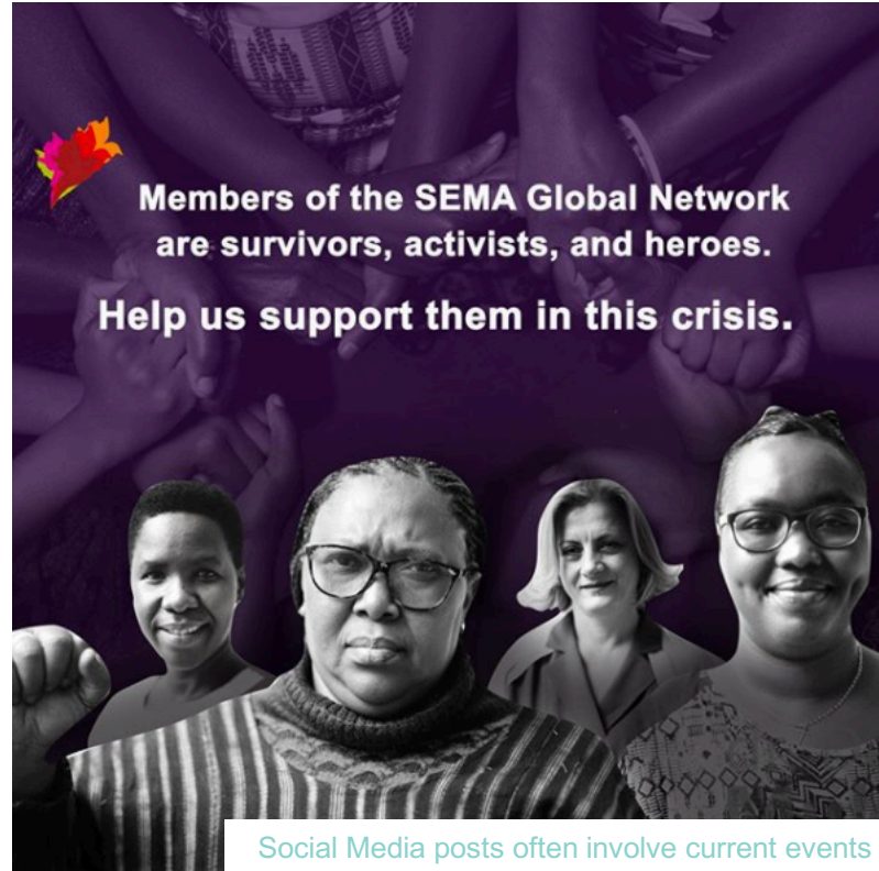
Social Media posts often involve current events

On Instagram, the Mukwege Foundation page has 7,124 followers. We post photographs from our work around the world as well as photo stories about survivors and their activism.