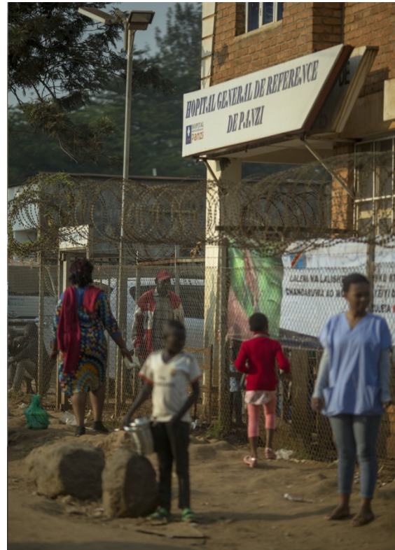
Holistic healing is also known as the Panzi Model.

Panzi's model of holistic care is structured around four pillars that deal with the interconnected consequences of sexual violence. Each survivor of sexual violence has a social assistant assigned to him or her from the start. Together they design a tailor-made healing pathway that includes: