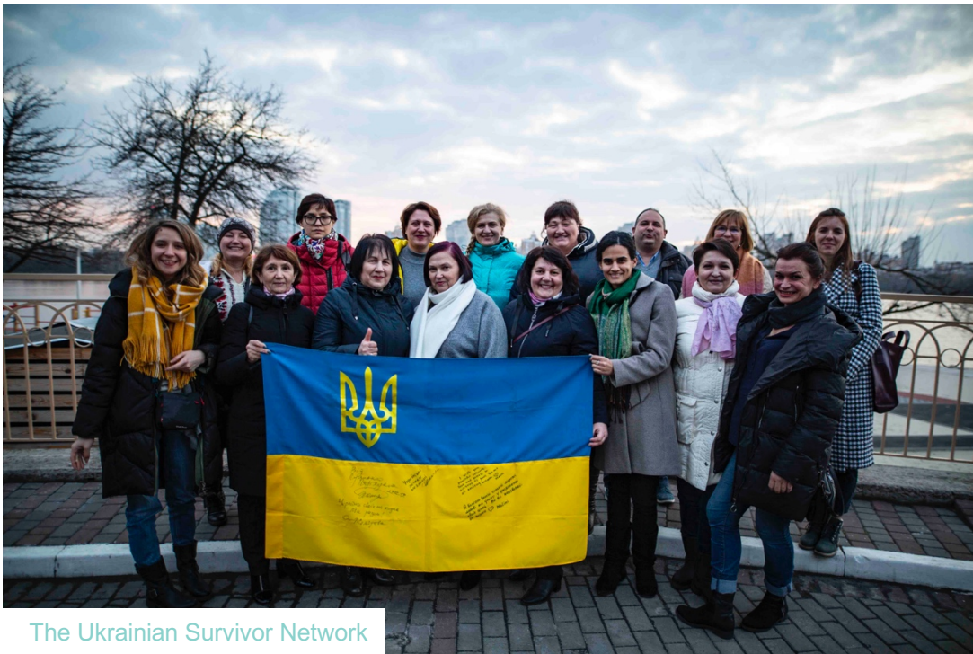
The Ukrainian Survivor Network

Two important state-level events addressing sexual violence were also held. On May 30, network members met at the Ukrainian Cabinet of Ministers to discuss this issue, and on June 19, the Ukrainian parliament discussed the issue to develop a position on how best to combat sexual violence connected with the armed aggression of the Russian Federation against Ukraine.