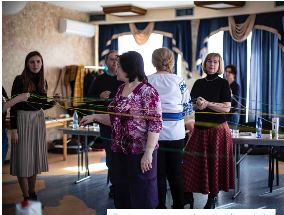
Survivors engage in a team- building activity in Kiev

In June 2019, network members received training on psycho-social care, to better communicate with women who have experienced violence. They learned about recovery techniques, and developed self-help skills in the process. As members intend to reach out to other women who suffered sexual violence during the conflict,