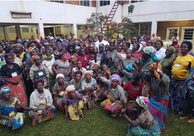
Members of the Movement of Survivors gather to celebrate Dr. Mukwege's Nobel Prize at Panzi Hospital.

who have formed committees to organise monthly meetings for their survivor membership, and coordinate a busy programme of community awareness-raising to tackle stigma and reach out to other victims of sexual violence.