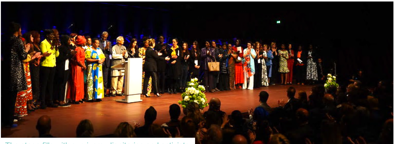
The stage fills with survivors, dignitaries and activists at Stand Speak Rise Up Forum in Luxembourg

reparations, survivors' movements, children born of rape, the role of technology in advocacy, the criminal justice system — all issues where the survivors' perspective is crucial for relevant action to be taken.