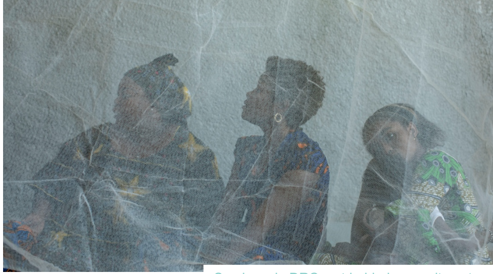
Survivors in DRC rest behind mosquito nets

In northeast Nigeria sexual violence has been used on a mass scale during the ongoing insurgency. Women and girls have been abducted by fighters belonging to Jama'atul ahl al-sunnah li da'awati wal jihad (JAS - known globally as Boko Haram), forcibly married to their captors and in many cases have become pregnant as a result of