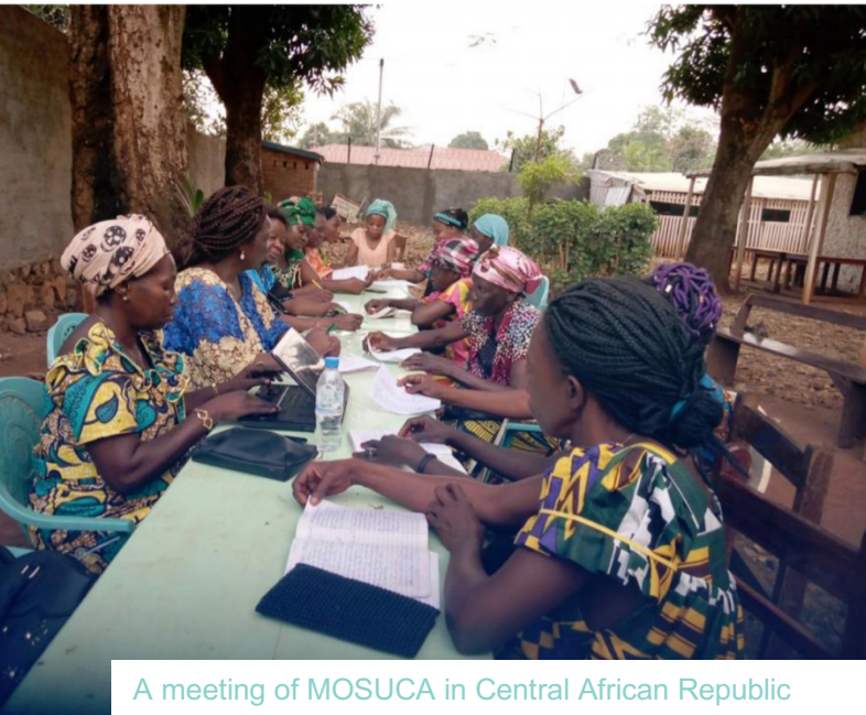
A meeting of MOSUCA in Central African Republic

For the International Day for the Elimination of Violence against Women (25 November 2019) MOSUCA marked the 16 days of activism with a national radio programme bringing together socio-economic advisors, women deputies, ministers, academics and survivors of sexual violence to raise awareness about the realities of conflict-related sexual violence.