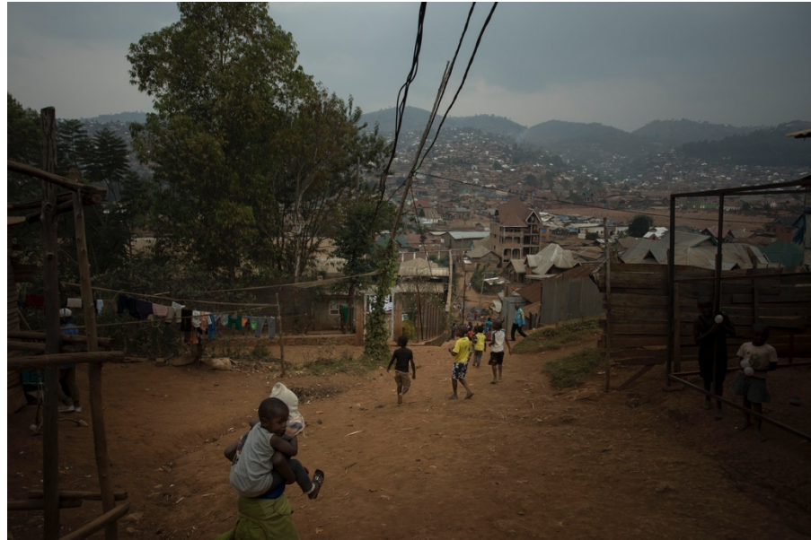
Streets of Bukavu, DRC

In 2019, with the support of the German Development Agency (GIZ) a collaboration