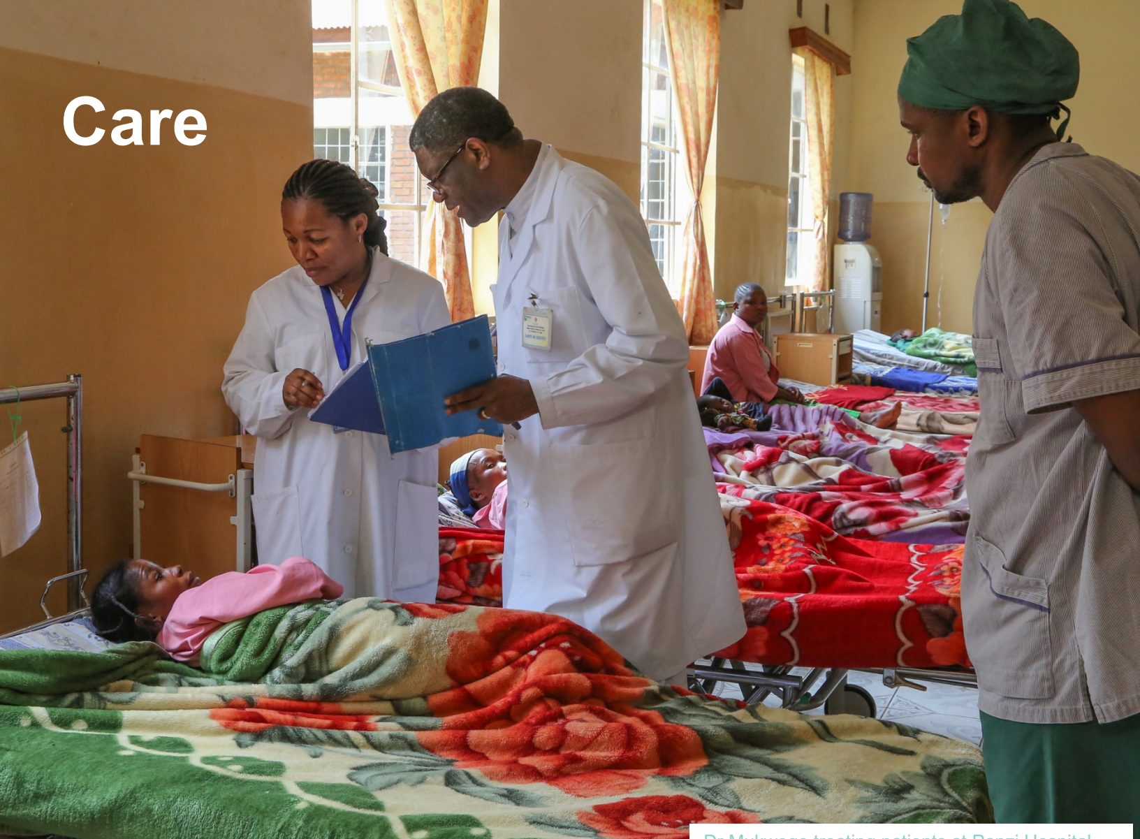
Dr Mukwege treating patients at Panzi Hospital