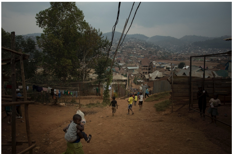
Streets of Bukavu, DRC

In 2019, with the support of the German Development Agency (GIZ) a collaboration