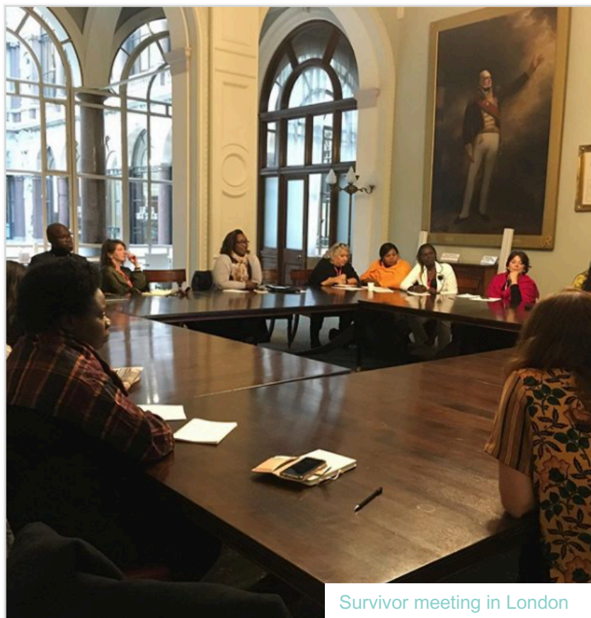
Survivor meeting in London

based survivor members of the NGO Freedom from Torture. They collaborated with the Institute for International Criminal Investigations (IICI) in the development of the Murad Code, in its early stages, which is intended to contain comprehensive guidelines for engagement with survivors of sexual violence in conflict.