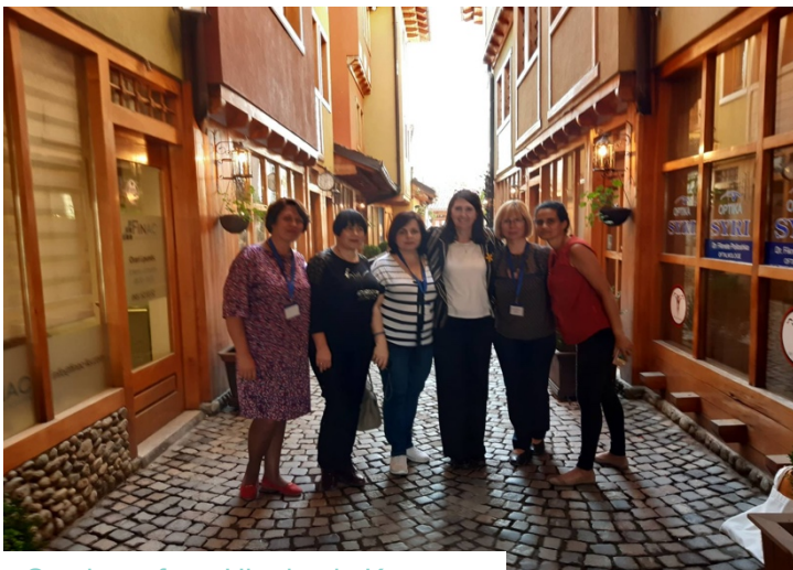
Survivors from Ukraine in Kosovo

For the Ukrainian survivors this exchange brought the realisation that survivors of conflict-related sexual violence were recognised in Kosovo only 15 years after the end of the war, and they were finally granted the status of victims, eligible to receive reparations, 20 years after the end of the war. This realisation gave them a strong impetus to try to accelerate the pace of change in Ukraine to recognise the rights of survivors of sexual violence. Also powerful was the opportunity to witness another SEMA member speaking out for the first