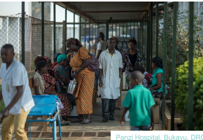
Panzi Hospital, Bukavu, DRC

started between the Mukwege and Panzi Foundations and the ICGLR Regional Training Facility (RTF) in order to reinforce survivors' access to quality holistic assistance in the Great Lakes Region. The collaboration focuses on the integration of Panzi's holistic model of care in the RTF's training activities, which form part of an ambitious regional programme to train thousands of Sexual and Gender based Violence (SGBV) professionals in ICGLR member states, utilising a training of trainers approach. This integrated training will be piloted in the Democratic Republic of Congo (DRC), Zambia, Rwanda, Uganda and the Central African Republic by joint