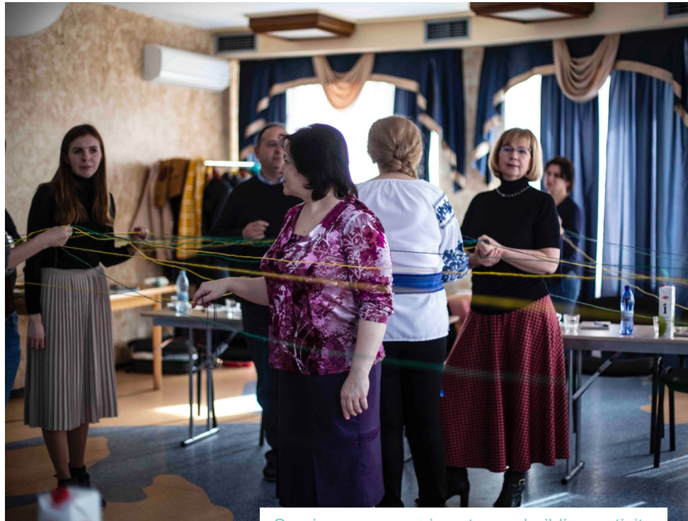
Survivors engage in a team- building activity in Kiev

In June 2019, network members received training on psycho-social care, to better communicate with women who have experienced violence. They learned about recovery techniques, and developed self-help skills in the process. As members intend to reach out to other women who suffered sexual violence during the conflict,