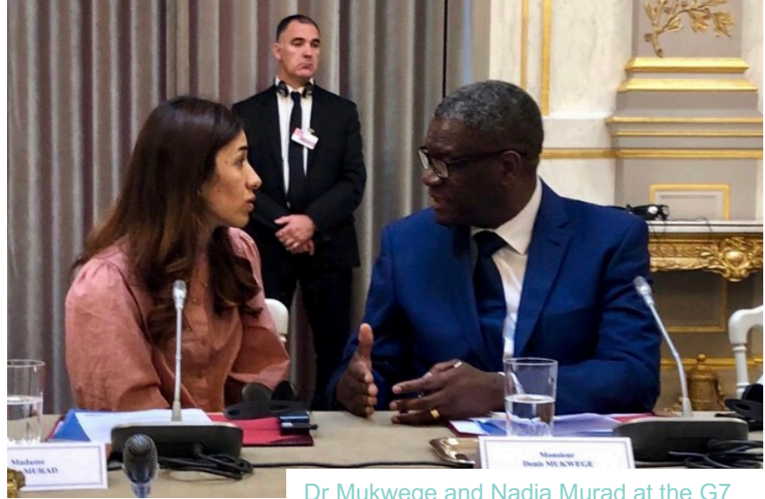
Dr Mukwege and Nadia Murad at the G7