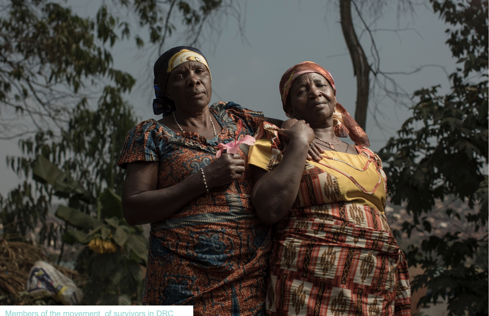
Members of the movement of survivors in DRC