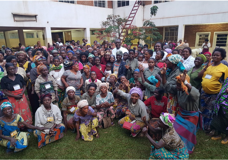
Members of the Movement of Survivors gather to celebrate Dr. Mukwege's Nobel Prize at Panzi Hospital.

who have formed committees to organise monthly meetings for their survivor membership, and coordinate a busy programme of community awareness-raising to tackle stigma and reach out to other victims of sexual violence.