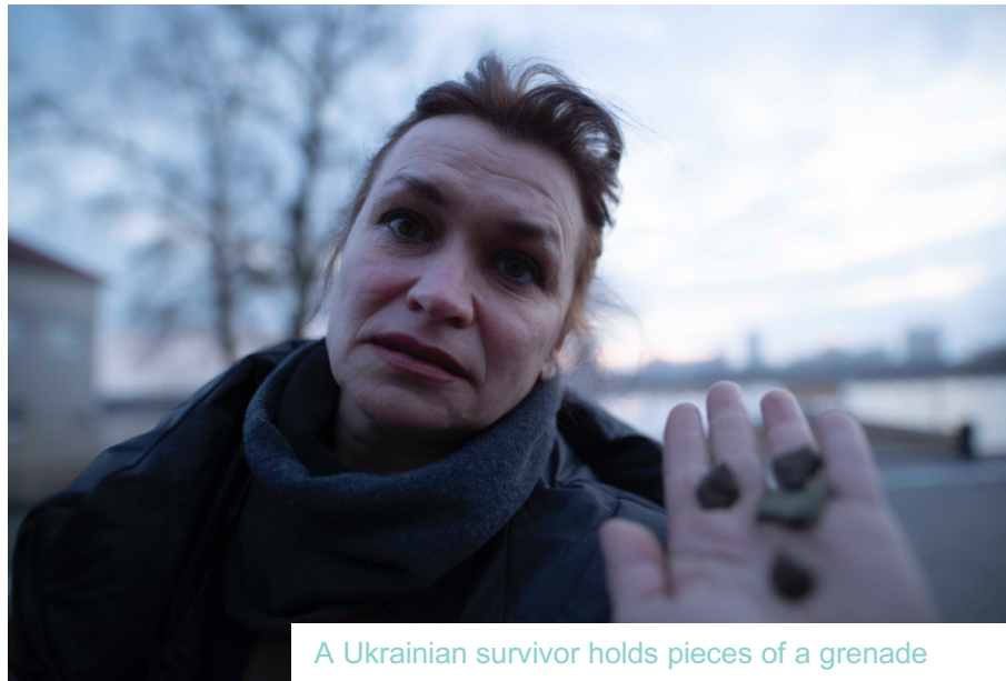
A Ukrainian survivor holds pieces of a grenade

Sexual violence has been used systematically by both sides in the armed insurrection in the Luhansk and Donetsk regions of Ukraine, and in the aftermath of Russia's occupation of Crimea. Women and men have suffered torture and sexual violence in illegal detention facilities and at checkpoints. Sexual violence has also been used to intimidate individuals and communities to force them to leave the territory. Victims report that they struggle to access appropriate psychological support, and stigma and fear of reprisals has meant that many survivors have not