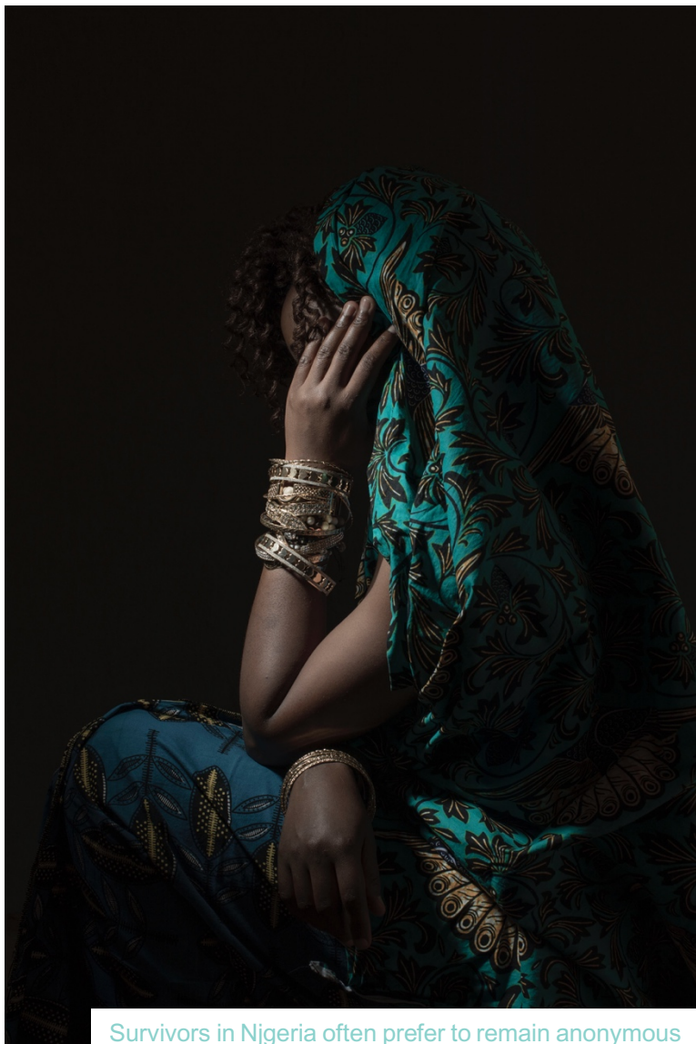
Survivors in Nigeria often prefer to remain anonymous

born of sexual violence are at even greater risk of rejection, abandonment and violence. Victims displaced in internally displaced person (IDP) camps in Northeast Nigeria's northeast face a humanitarian crisis, with