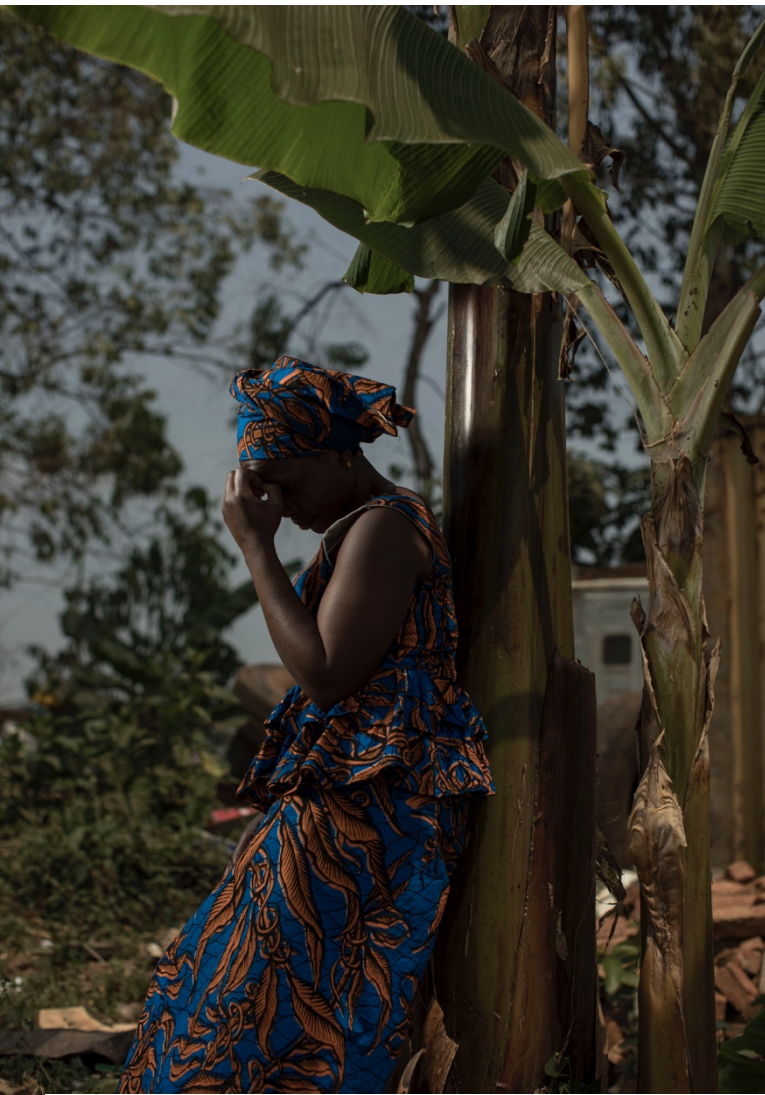
Stigma can be an overwhelming obstacle to survivors' healing process

community members either to witness or take part in these atrocities, perpetrators impact the whole community, destroying social bonds and relationships. As a weapon of conflict, sexual violence aims to demoralise a community or a whole ethnic group, destroying their resilience and ability to rebuild and recover.