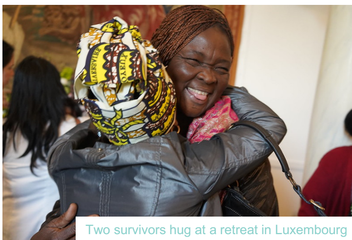
Two survivors hug at a retreat in Luxembourg

gender-based violence (techniques easily replicated in their local networks), received individual coaching, and engaged in team building.