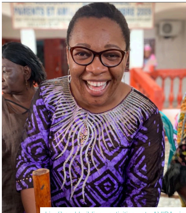
Livelihood-building activities at AVIPA in Conakry, Guinea

In mid-2019, the Mukwege Foundation conducted a monitoring mission to Guinea, together with Panzi expert trainers. The professionals went on to train about 100 more local SGBV professionals in Conakry and the other communities targeted by the project.