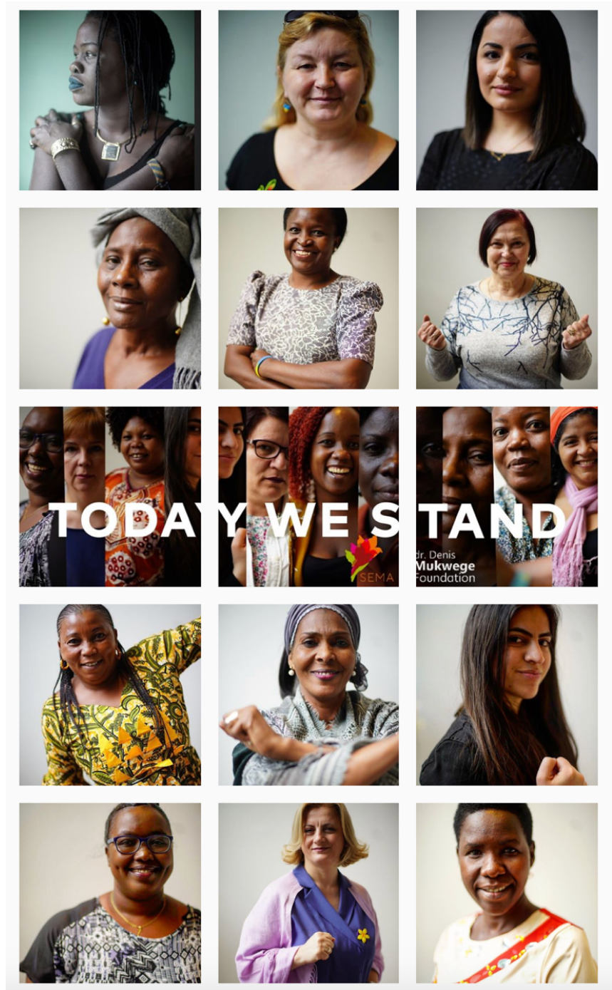
Instagram during the #StandbySurvivors campaign

In 2019, we also featured a few short campaigns, featuring a VIP screening of Rising Silence- a documentary about the Birangona survivors of Bangladesh- as well as the Global Survivors Fund launch and holiday messaging.