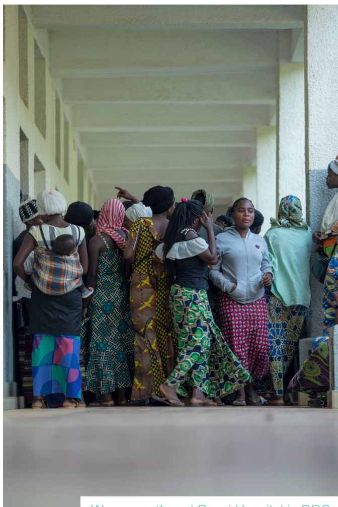
Women gather at Panzi Hospital in DRC

teams of Panzi expert trainers and trainers selected by the RTF. Several learning exchanges took place between May and November 2019. These meetings brought together a total of 60 trainers and experts and allowed the teams to exchange experiences both on training approaches and tools, as well as on key themes within Panzi's expertise, like holistic care,