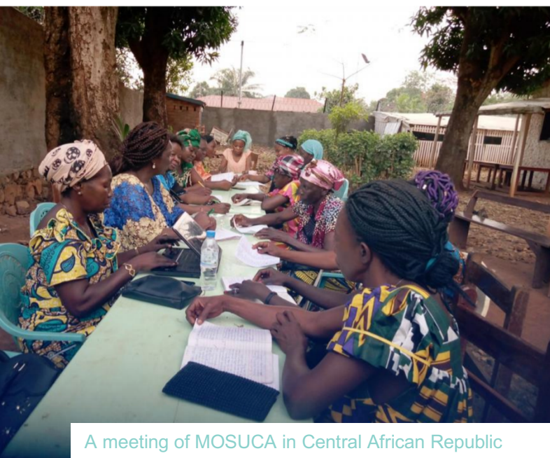
A meeting of MOSUCA in Central African Republic

groups battling for control over territory. Survivors decided to break the silence and unite in a movement to fight against sexual violence, and to prevent new generations from facing the same atrocities. On 10 December 2018, the anniversary of the 1948 signing of the Universal Declaration of Human Rights, MOSUCA — ‘Mouvement des Survivantes de Violences Sexuelles en Centrafrique’ — was launched in front of an audience of 500 at the National Parliament. The CAR network was initially composed of survivor-representatives of six local victims’ organisations, and 25 Bangui members.