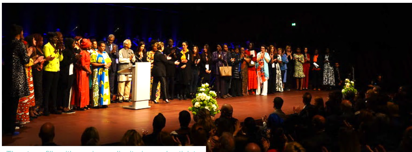
The stage fills with survivors, dignitaries and activists at Stand Speak Rise Up Forum in Luxembourg

reparations, survivors' movements, children born of rape, the role of technology in advocacy, the criminal justice system — all issues where the survivors' perspective is crucial for relevant action to be taken.