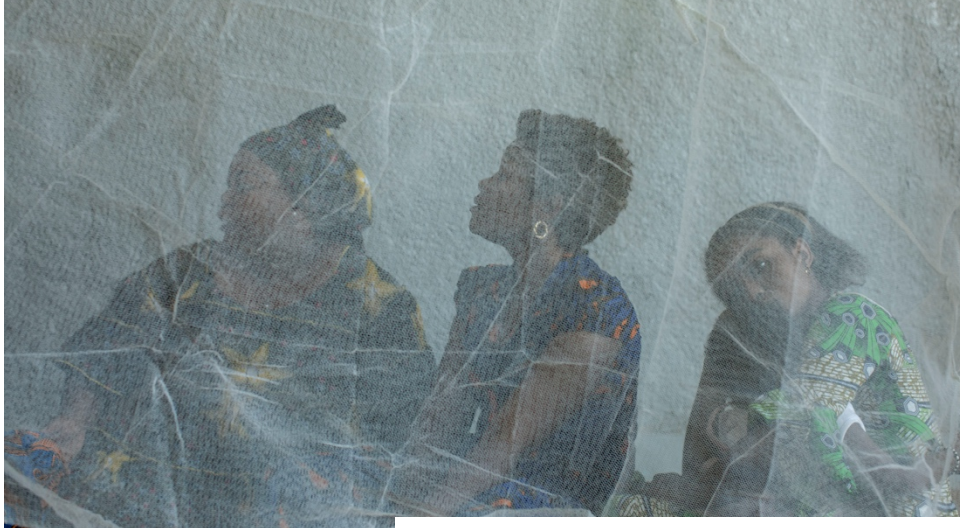
Survivors in DRC rest behind mosquito nets

Network members have organised an average of 8 awareness-raising sessions per month aimed at survivors, school students, and community members. Survivors have spoken on important issues such as the need to break the silence, countering harmful myths and showing the reality of sexual violence as a weapon of war, and ways to fight against stigma and