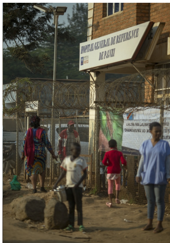
Holistic healing is also known as the Panzi Model.

Panzi's model of holistic care is structured around four pillars that deal with the interconnected consequences of sexual violence. Each survivor of sexual violence has a social assistant assigned to him or her from the start. Together they design a tailor-made healing pathway that includes: