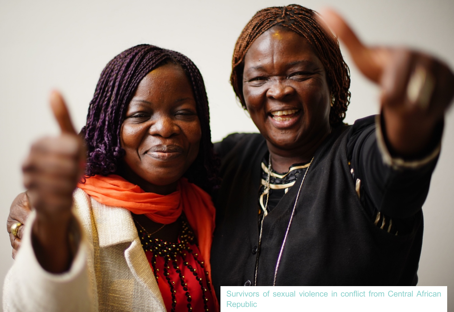
Survivors of sexual violence in conflict from Central African Republic

Wherever possible, we connect survivor activists and networks with the wider civil society 'landscape' at a local level for mutual learning and sustainability, and to coordinate joint advocacy towards service providers and authorities.