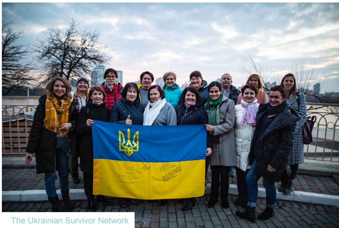
The Ukrainian Survivor Network

Two important state-level events addressing sexual violence were also held. On May 30, network members met at the Ukrainian Cabinet of Ministers to discuss this issue, and on June 19, the Ukrainian parliament discussed the issue to develop a position on how best to combat sexual violence connected with the armed aggression of the Russian Federation against Ukraine.